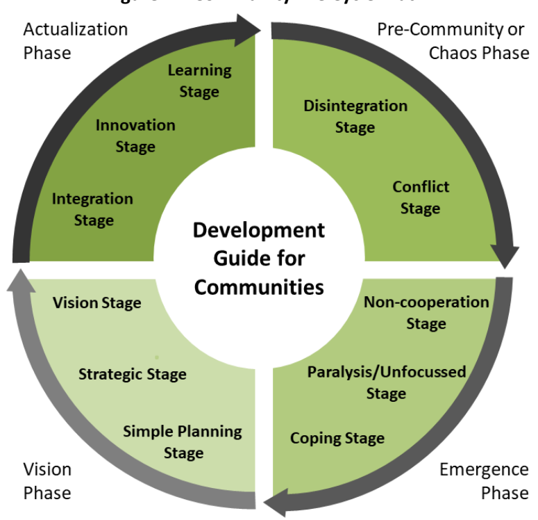
Figure 1 - Community Life Cycle Matrix

Every community, particularly smaller communities, move through life cycles just as our national economy moves through periods of economic expansion and then contraction. As a community coach, understanding where a community is in within its life cycle can greatly enhance your ability to help the community you are working with to move forward. We have long employed this simple but sophisticated graphic: