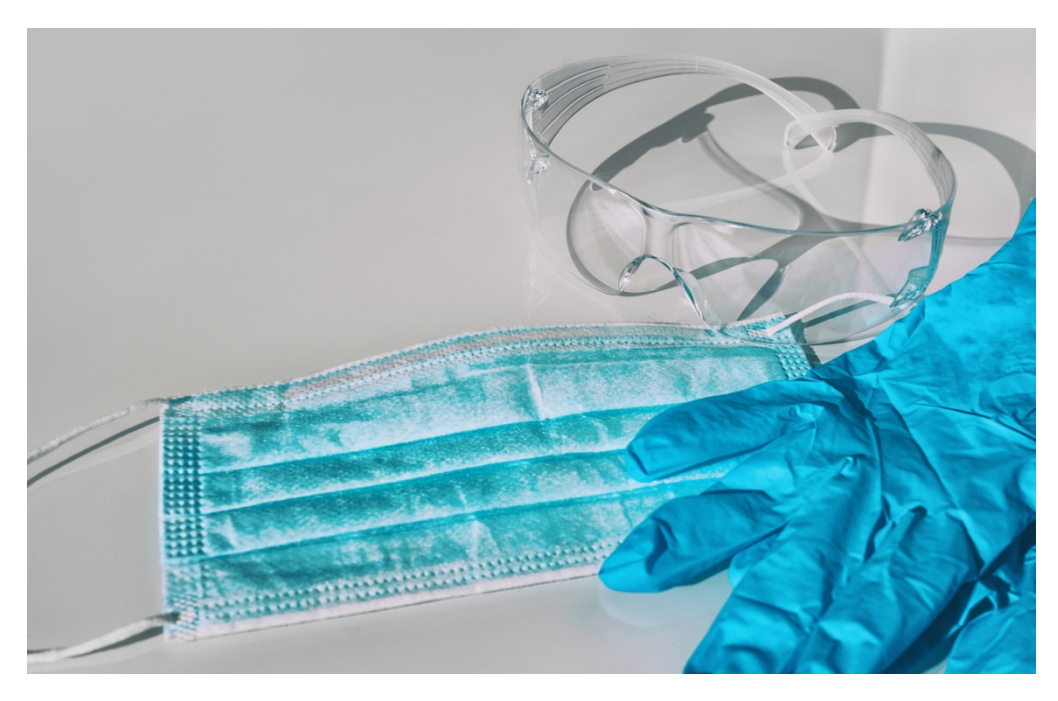
Blue Cross Blue Shield of Kansas – NetWork Kansas Initiative A Creative Solution for Producing PPE in Kansas