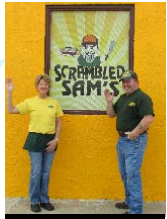
Breakfast Restaurant BANK - $52,000 RCEC - $40,000 RC RLF - $5,000