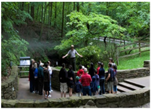
Mammoth Cave National Park in Rural Kentucky

Before we explore the development opportunities associated with tourism, we provide our e2 definition of what is included in this term.