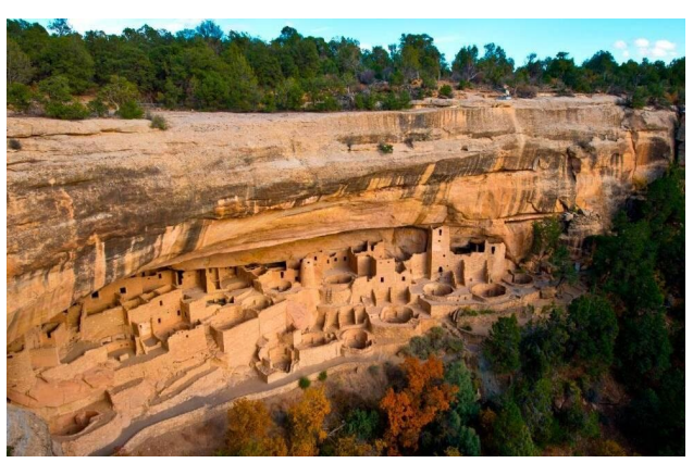
Cliff Dwellings in Mesa Verde National Park

Heritage, History and Culture. The four corners where Colorado, Arizona, New Mexico, and Utah come together is blessed with remarkable heritage sites, often rooted in the ancient peoples who built the Cliff Dwellings in Mesa Verde. In Wamego, Kansas, find the Oz Museum and the Celebrations' Haunted Opera House. Throughout the United States there are significant and less significant heritage, historical, and cultural sites. There is a segment of the travelling public looking to experience these sites, wanting to learn and be there first-hand. Reading about Gettysburg Battlefield is one thing; spending a couple of days there is profoundly different.