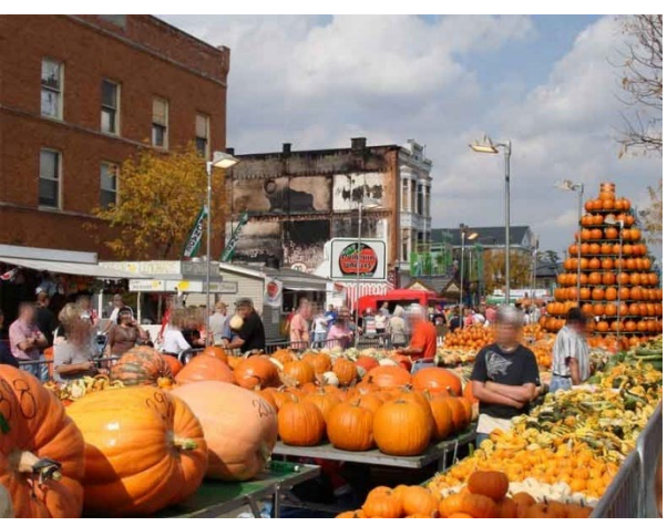
Circleville, Ohio's Pumpkin Festival

The important lesson is that almost every rural community has some visitor attraction opportunities. Clearly, some communities like Custer, South Dakota, or the Florida Keys have more to offer with associated bigger drawing power. Exploring the assets your community has to attract visitors and tourists can strengthen your community and diversify your economy.