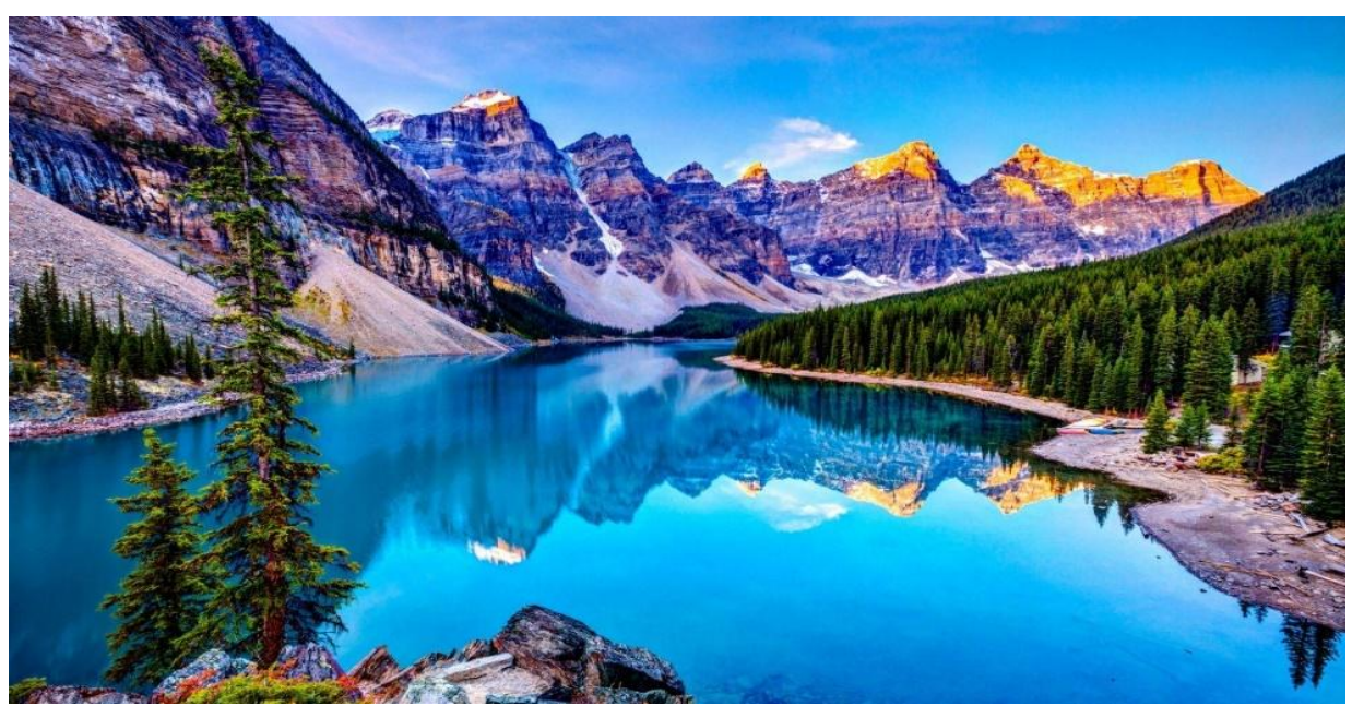
Continental Divide in Rocky Mountain National Park

In 2020 and 2021, the world pandemic health crisis has dramatically impacted our freedom to travel and even attend our favorite local café, coffee shop, or theater. As hope rises with increasing vaccinations by mid-year 2021, we will begin to travel once again. For America, rural America offers diverse playgrounds from well-known parks, like Rocky Mountain National Park near Estes Park, Colorado, to the resorts along the Mexican Riviera. For my wife, myself, and our family, these two destinations are annual events. In the depths of winters with cold and weak sunshine, we travel to the Mexican Riviera for a week's break, soaking in the sun and spectacular Mexican hospitality. When temperatures rise above 100 degrees and humidity lasts throughout the night, we travel to the Rockies for warm days, spectacular hiking trails, vistas, and cool nights.