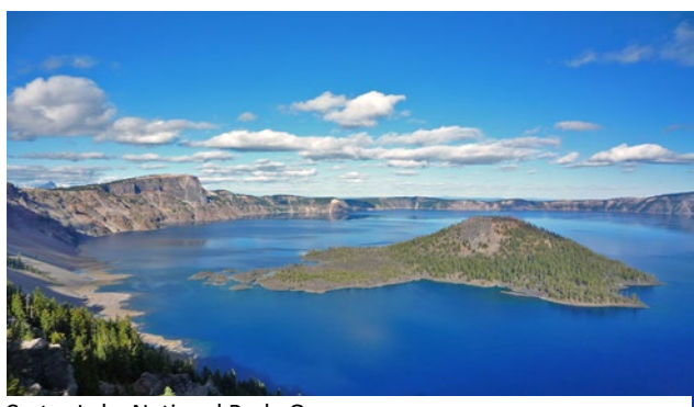
Crater Lake National Park, Oregon

Natural Wonders. Whether it is Arcadia on the Maine coast, the faces in South Dakota's Black Hills, or Crater Lake in Oregon, America is filled with natural wonders, including seashores, forests, mountains, heritage sites - the list goes on and on. Within the National Park Service alone (e.g., not counting private, state, and local natural wonder sites) there are nearly 600 national parks, monuments, and other sites. These sites are spread throughout the 50 states and Territories of the United States. With most major natural wonder sites, there are gateway communities