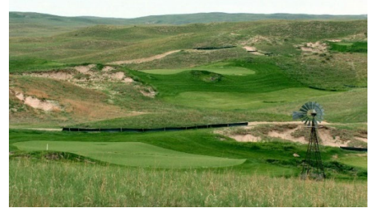
Dismal River Golf Club, Nebraska Sandhills

Local Venture Development. Tourism can be rooted in large-scale, corporate-owned, external investor-rooted development. Much tourism activity and the services visitors require are usually provided by smaller and often locally owned and operated ventures, including for-profit businesses, nonprofits, and governmental enterprises. While many tourism jobs are seasonal, part-time, and relatively low paying, the preponderance of small businesses owned and operated locally creates a more rooted economy.