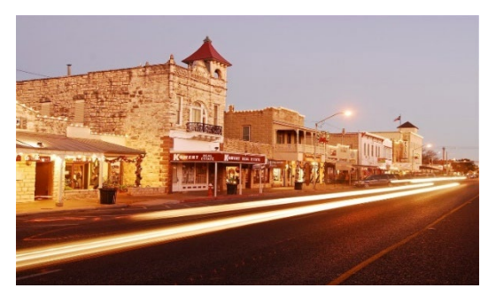
Downtown Fredericksburg, Texas

Recreation. Recreational tourism is increasingly important. In so many ways, Rural America is a big part of urban America's playground. Recreational tourism includes a wide range of activities from snow skiing in Vermont, to ATV trail riding in Central Appalachia, to sailing in the American Virgin Islands, to boating on an area lake. Some of these assets draw a few thousand recreational tourists each year, and others draw millions. These visitors need services, creating entrepreneurial development opportunities.